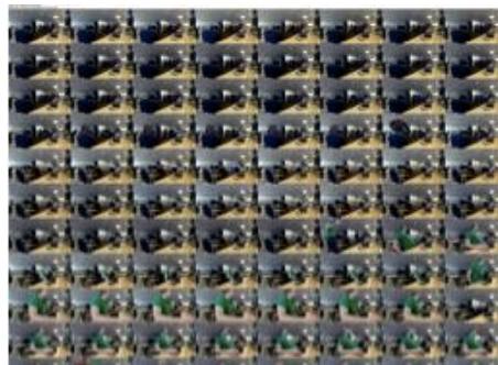
Fig. 2: Portion of thumbnail of video

Post-huddle discussions comprise 7% of this video, and 6% of the total sketching time. Most of this time (82%) involved sketching on the whiteboard during design discussions.