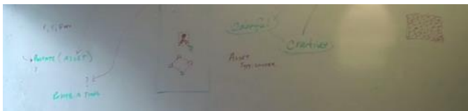
Fig. 3: Sketching from longest sketching session of Feb 19 and 21. The two ovals and lines in the top middle were there before this session began.

At the same time, in analysing this conference room episode in more detail, we came to see that it complicates prior notions of sketching and accounting for the duration and uses of sketches. “Sketching” involves not only making marks on a surface, since this only accounted for a small percentage of the time taken during this session. The software developers also spent considerable time augmenting the sketch with words, gestures, and deictics. They also spent time during this session oriented to the sketch, but rather than augmenting what was drawn, they spoke about alternatives in relation to what they had sketched. And finally, there was a considerable part of this session, in which the developers sat nearby the sketch, but never oriented their bodies toward it nor made any verbal reference to it. Which of these activities, then, is sketching? In counting all of it, we drew an analytical boundary that is somewhat artificial, a point we return to in the Discussion.